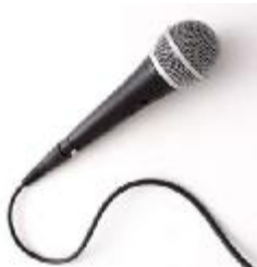
dynamic handheld microphone with on/off switch & 5m cable

Complete 30w PA system c/w 100m drum of speaker cable, 3 x loudspeaker connectors, 12v DC lead, 30w mixer amplifier with 13a mains lead, dynamic mic with on/off switch and 5m cable and two outdoor horn loudspeakers with wiring and installation guides