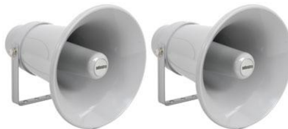
2 x 100v line PA reflex horn speakers, 273 x 205mm

Bass & treble controls Peak and signal LED's