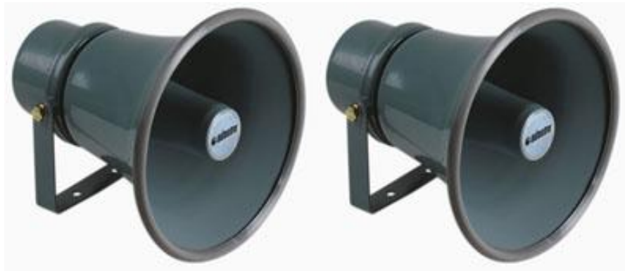
2 x 100v line PA reflex horn speakers, 266 x 236mm