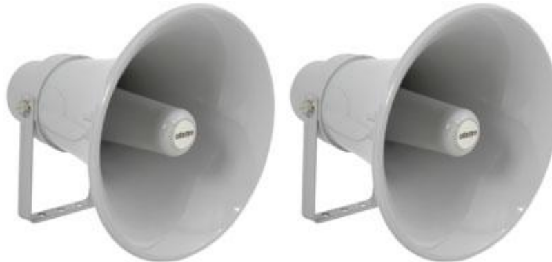
2 x Adastra 100v line PA reflex horn speakers, 315 x 310mm

Bass & treble controls Peak and signal LED's