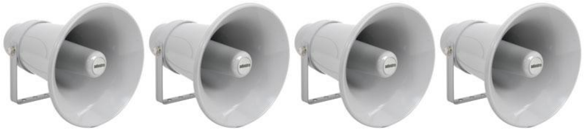
4 x 100v line PA reflex horn speakers, 273 x 205mm

Bass & treble controls Peak and signal LED's