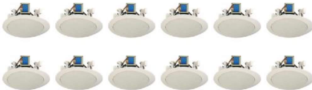
12 x white 6w -100v line ceiling loudspeakers

Channel 1 electronic balanced 8 ohm and 100V line outputs Mains and battery operation