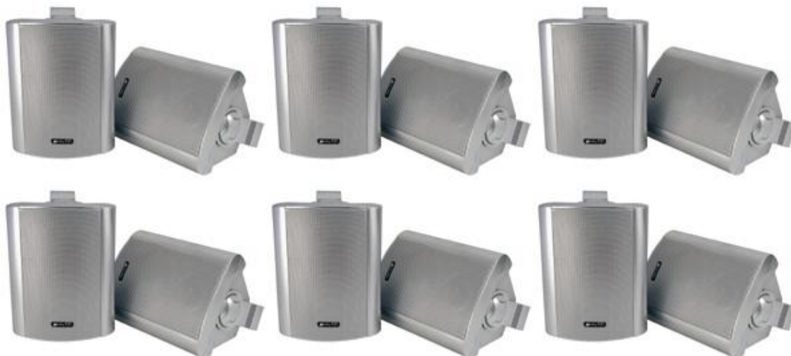
12 x white 100v line wall mount cabinet loudspeakers with fixing brackets (black to special order)

Channel 1 electronic balanced 8 ohm and 100V line outputs Mains and battery operation