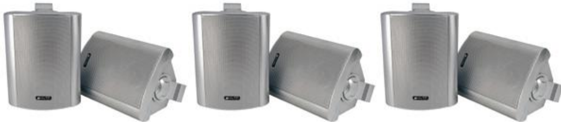
6 x white 100v line wall mount cabinet loudspeakers with fixing brackets (black to special order)

Channel 1 electronic balanced 8 ohm and 100V line outputs Mains and battery operation