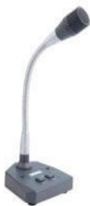
Adastra 952.190 – dynamic desk paging microphone with on/off switches & 5m cable

A Complete 60w PA system c/w 100m speaker cable, 60w mixer amplifier with mains lead with 13a mains plug, dynamic desk paging microphone with on/off (PTT talk) switches and 5m cable and six indoor cabinet loudspeakers – includes UK mainland delivery.